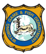
Table Mountain Wildlife Habitat Management Area