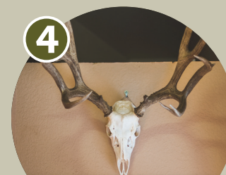
4 SKULL, SKULL PLATE OR ANTLERS THAT HAVE BEEN CLEANED OF ALL MEAT AND BRAIN TISSUE; TEETH