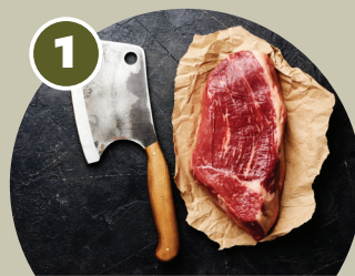
1 CUT AND WRAPPED MEAT