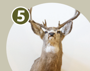
5 FINISHED TAXIDERMY MOUNTS