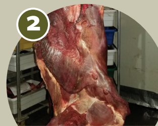
2 EDIBLE PORTIONS WITH NO PORTION OF THE SPINAL COLUMN OR HEAD ATTACHED