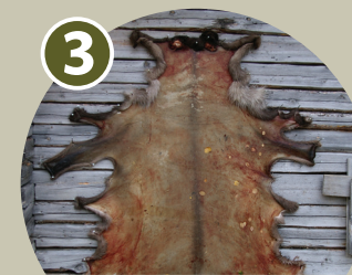
3 CLEANED HIDE WITHOUT THE HEAD ATTACHED