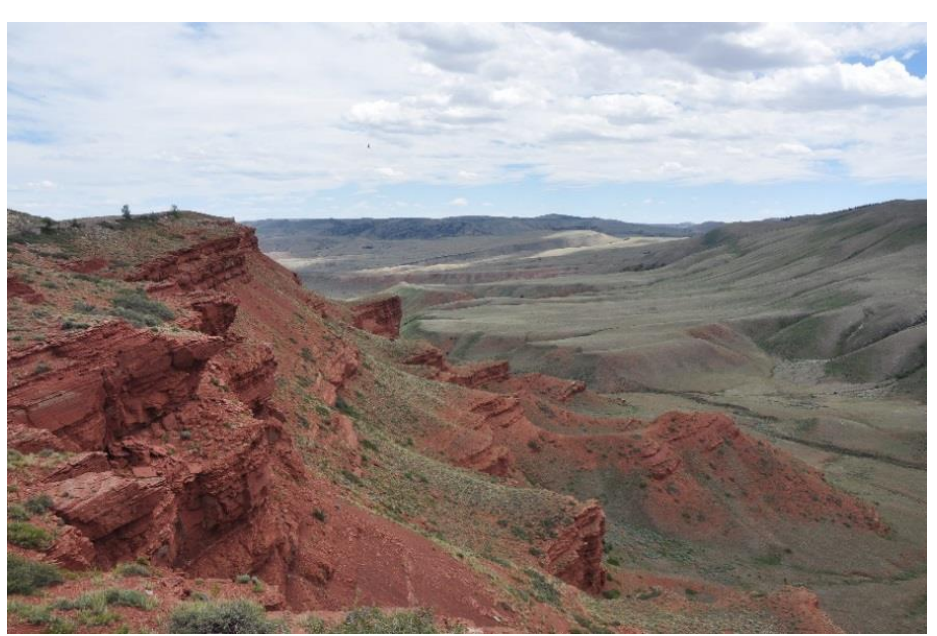
Figure 3: Rock outcrop typical of Western Small-footed Myotis roosting and foraging habitat in Fremont County, Wyoming.