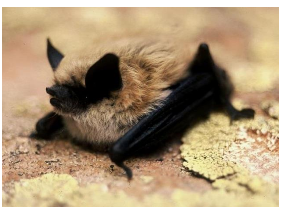
Figure 1: A Western Small-footed Myotis in Wyoming.