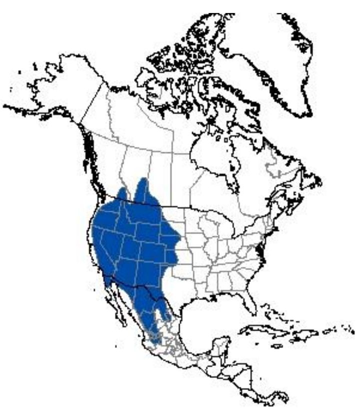
Figure 2: North American range of Myotis ciliolabrum . (Map from: Patterson, B. D., et al. (2007) Digital Distribution Maps of the Mammals of the Western Hemisphere, version 3.0, NatureServe, Arlington, Virginia.)