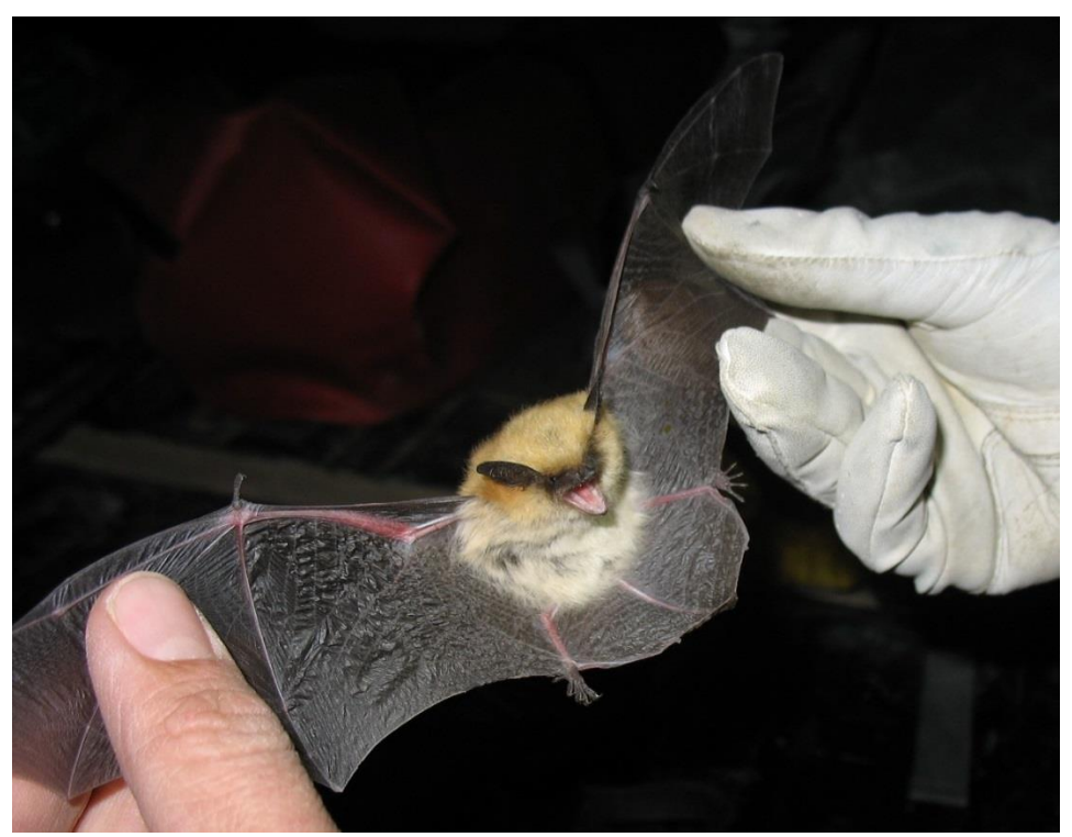
Figure 5: Ventral view of a Western Small-footed Myotis captured in Wyoming.