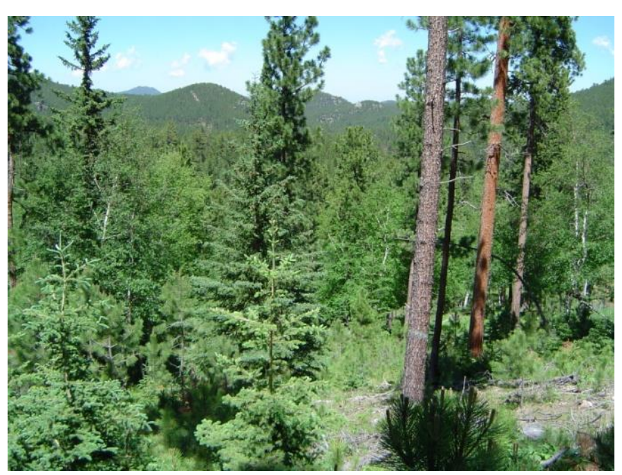
Figure 3: Northern Flying Squirrel habitat in the Black Hills, South Dakota.