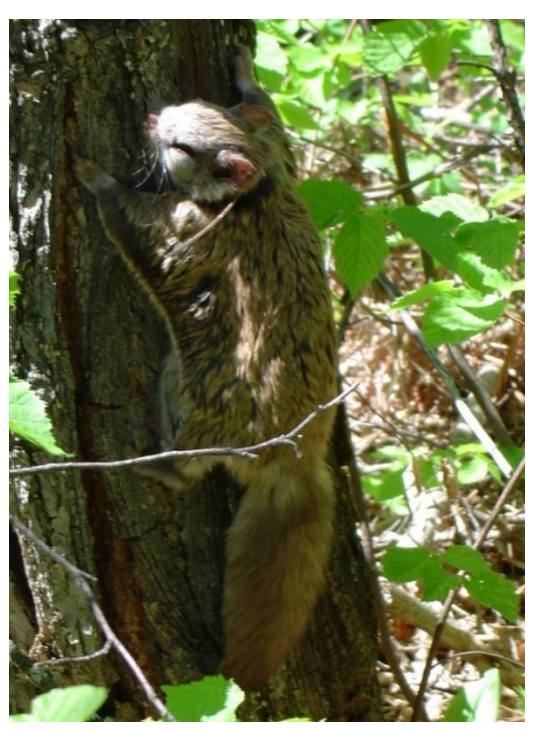
Figure 1: A radio-collared adult Northern Flying Squirrel in the Black Hills, South Dakota.