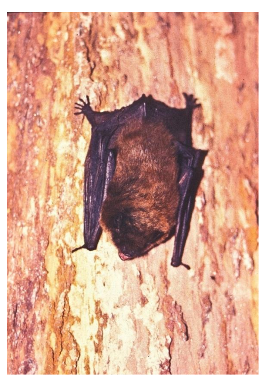
Figure 1: Adult Long-legged Myotis.