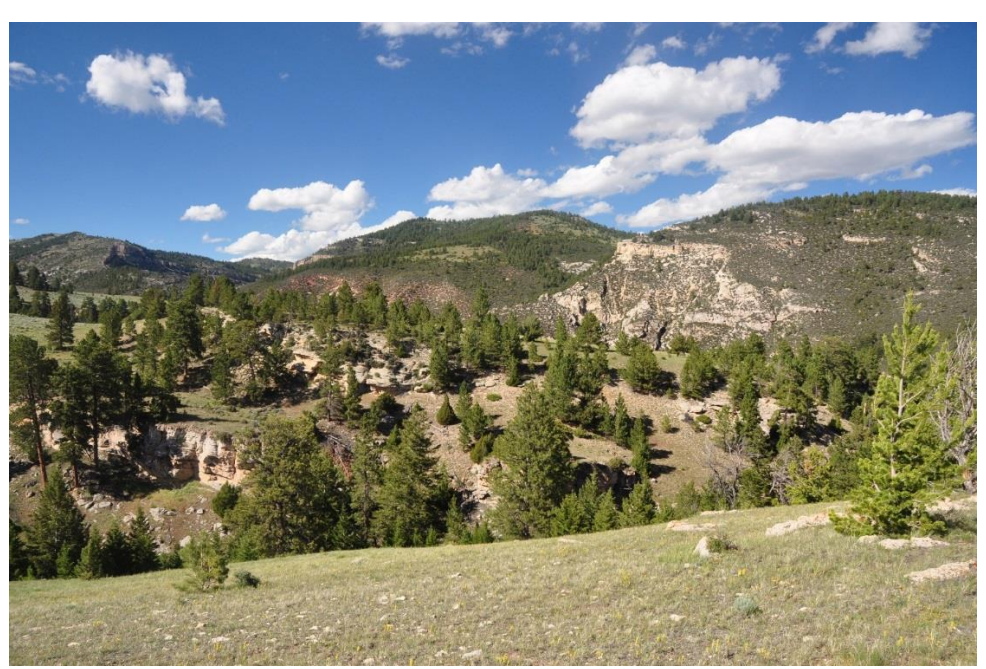
Figure 3: Mixed montane forest where Long-legged Myotis was documented in the Bighorn Mountains, Wyoming.