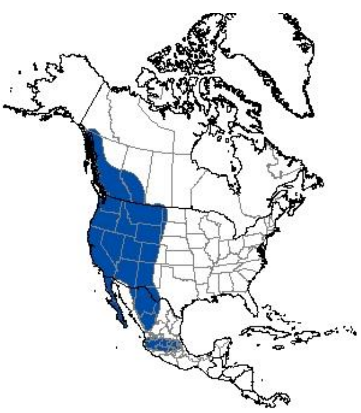
Figure 2: North American range of Myotis volans . (Map from: Patterson, B. D., et al. (2007) Digital Distribution Maps of the Mammals of the Western Hemisphere, version 3.0, NatureServe, Arlington, Virginia.)