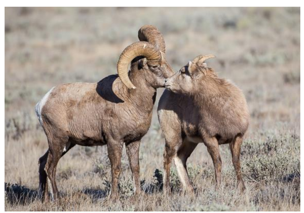
Figure 1: Adult male (left) and female (right) Bighorn Sheep in Teton County, Wyoming.