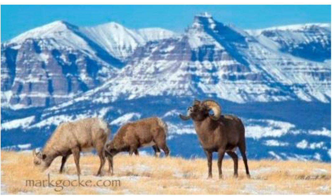
Figure 3: Rocky Mountain Bighorn Sheep on grassland winter range.