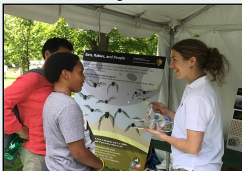
Education and outreach

Who: Eligible students will be in their 4 th year of veterinary training during the time of the externship. Six to eight students will be accepted each year.