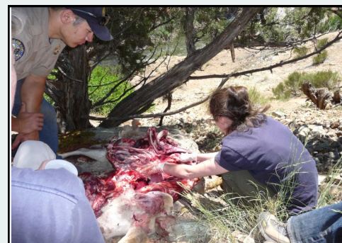
Wildlife necropsy and pathology