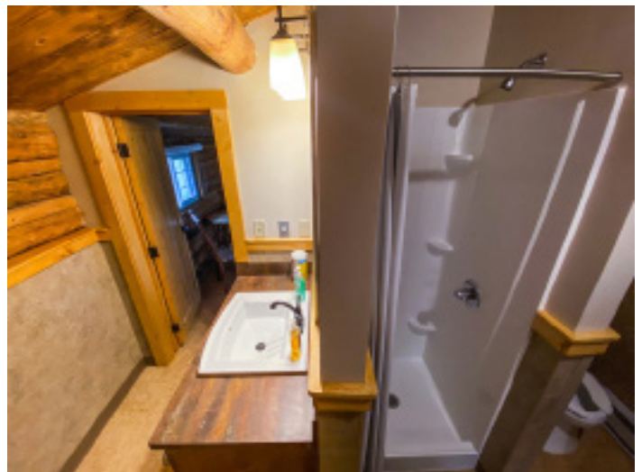
Photos inside of cabins.