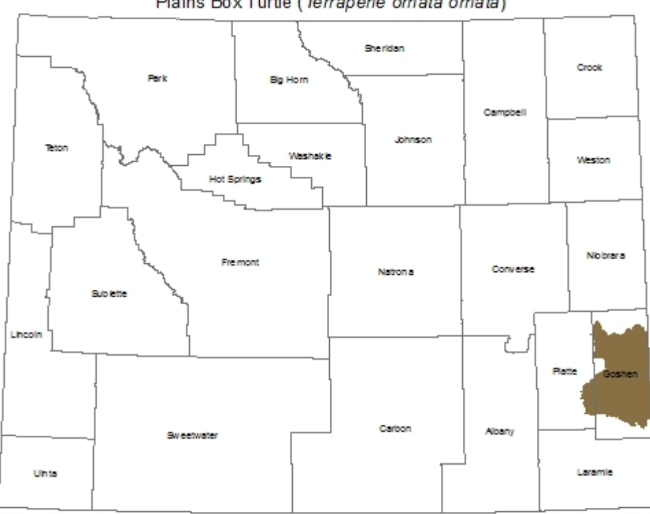
Plains Box Turtle (Terrapene ornata ornata)