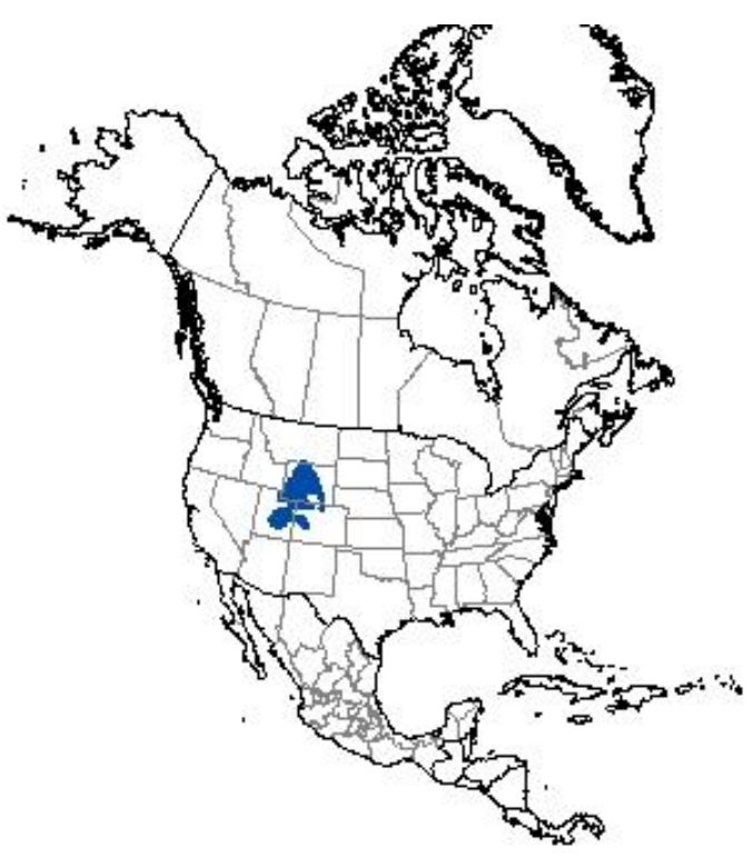
Figure 2: North American range of Cynomys leucurus . (Map from: Patterson, B. D., et al. (2007) Digital Distribution Maps of the Mammals of the Western Hemisphere, version 3.0, NatureServe, Arlington, Virginia.)