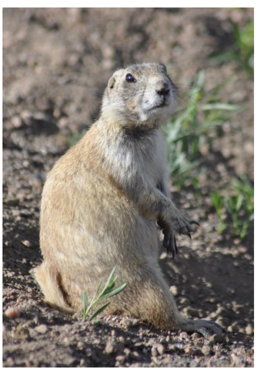
Figure 1: Adult White-tailed Prairie Dog in Albany County, Wyoming.