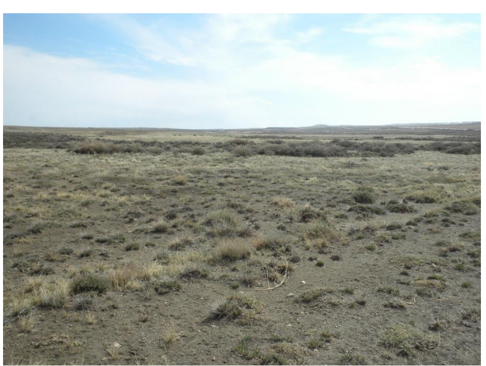
Figure 3: White-tailed Prairie Dog habitat in Shirley Basin, Wyoming.