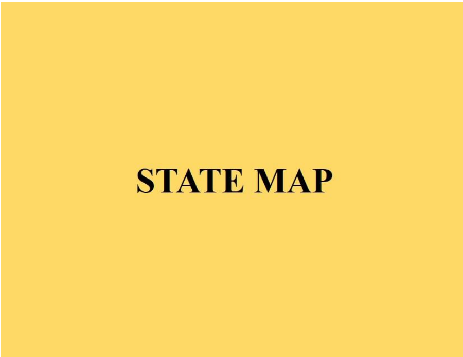
Figure 4: Map not available.