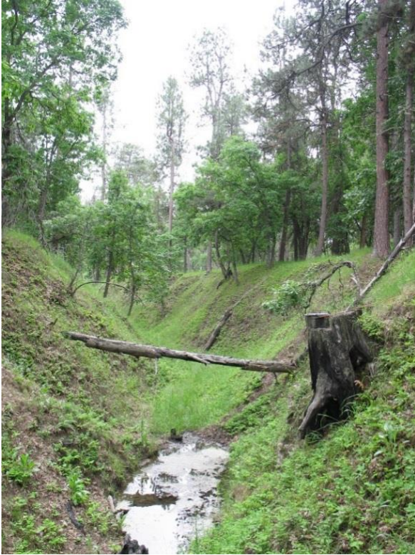
Figure 3: Northern Long-eared Myotis habitat near Devils Tower National Monument in Crook County, Wyoming.