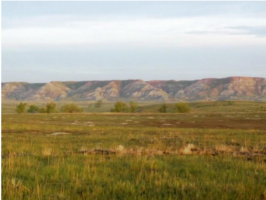
Figure 3: Black-tailed Prairie Dog habitat in Thunder Basin National Grassland near Newcastle, Wyoming. The mounds of the colony can be seen in the distance.