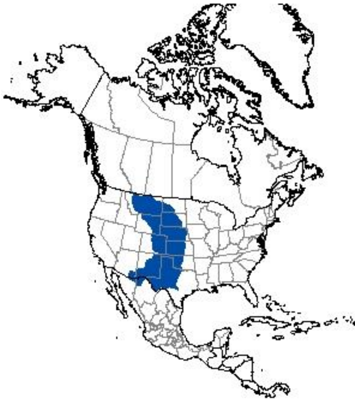
Figure 2: North American range of Cynomys ludovicianus . (Map from: Patterson, B. D., et al. (2007) Digital Distribution Maps of the Mammals of the Western Hemisphere, version 3.0, NatureServe, Arlington, Virginia.)