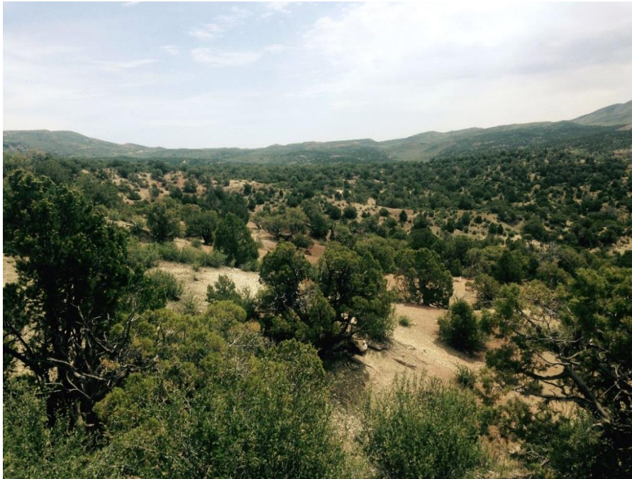
Figure 3: Woodhouse's Scrub-Jay habitat in southwestern Wyoming, dominated by Utah Juniper.