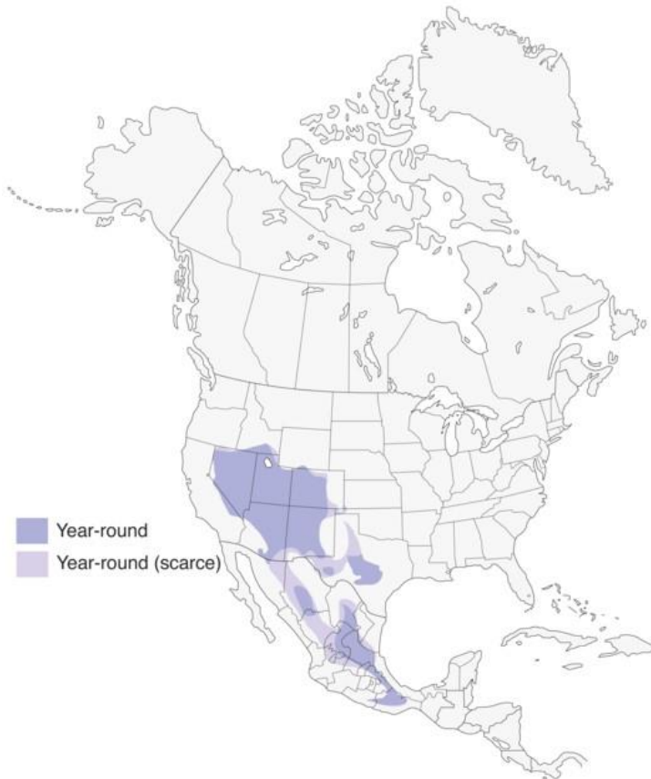
Figure 2: North American range of Aphelocoma woodhouseii . (Map courtesy of Birds of North America, http://bna.birds.cornell.edu/bna , maintained by the Cornell Lab of Ornithology)