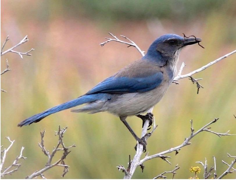
Figure 1: Adult Woodhouse's Scrub-Jay in Jefferson County, Colorado.