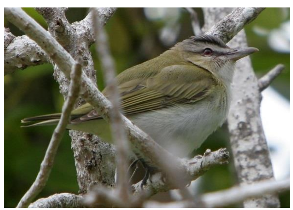
Figure 1: Adult Red-eyed Vireo in Laramie County, Wyoming.