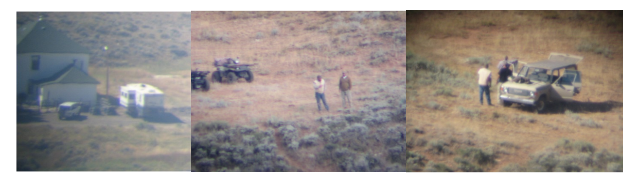
Surveillance photos of suspects during September, 2009.

Acting on tips from concerned citizens, game wardens Jason Hunter and Kelly Todd put six hunters on the 9V under surveillance September 14-17, 2009. Watching from neighboring property, the officers observed elk and mule deer killed with rifles during a period when only the archery season was open. On September 18, the officers served a search warrant on the ranch's buildings and collected deer and elk parts, along with portions of a 2009 resident elk and deer license issued to Schakel. The officers also seized fish, rifles, ammunition, two ATVs and a 1986 Toyota Land Cruiser used in the hunts.