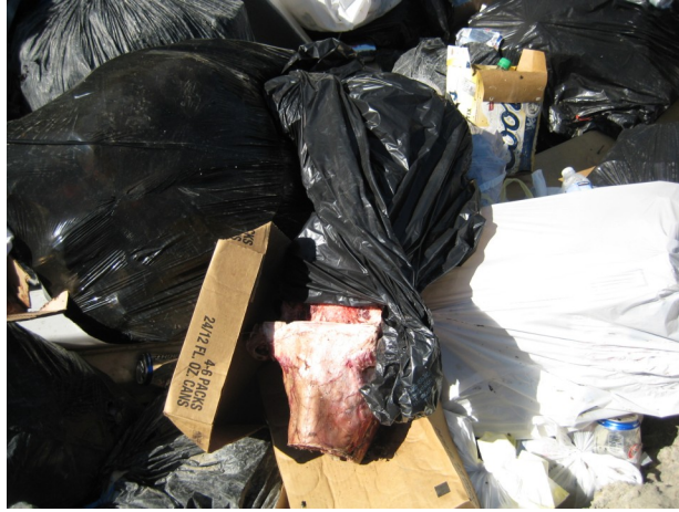
Dirty job—Investigators search through trash left behind by suspects to recover evidence.

With the suspects leaving the day before the search warrant was issued, suspects were identified from matching license plates to driver's license photos and interviews with informants.