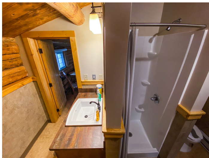
Photos inside of cabins.