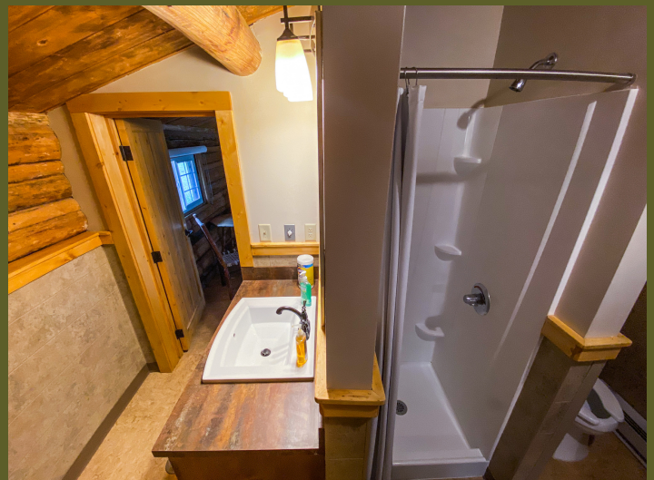
Photos of inside cabins.