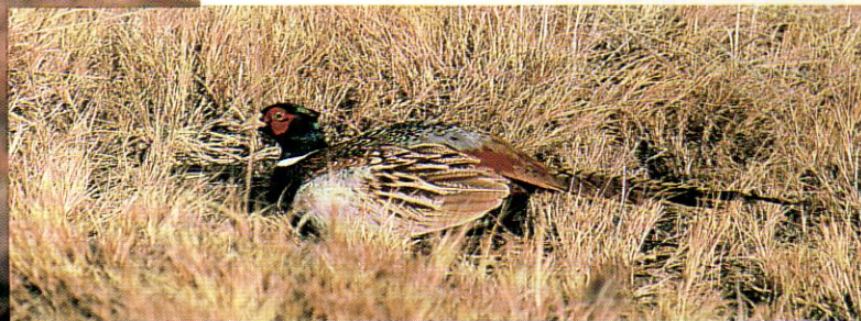
chukar partridge (left) and ring-necked pheasant