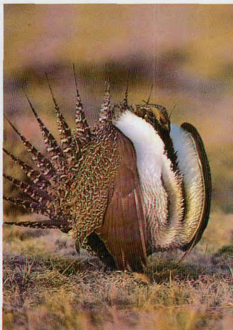
Mixed stands of sagebrush of different ages along with grassy openings and water make ideal sage grouse habitat (above). Traditional spring mating grounds (right) also need to be protected.

The timing and extent of chemical, mechanical, or controlled burn treatments to decrease sagebrush cover should be considered. Herbicides such as 2,4-D should be sprayed as early in spring as possible or prior to the emergence of forbs. Spray rates of 1 to 1.5 pounds of active ingredient per 3 gallons of water per acre are suggested. By spraying the chemical Roundup ( Monsanto Chemical) during winter, only vegetation above the snow is killed, while nontarget forbs below the snow surface are not affected. Chaining is preferred over spraying for sagebrush control