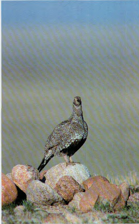
Female sage grouse.

Travel lanes of continuous sagebrush should be provided for hen and brood summer migration to moister ranges at higher elevations as lower areas dry up. Hens and broods are strongly attracted to lush hay meadows and alfalfa fields during late summer. To enhance their survival in these areas, mowing should be delayed until after mid-July and/or a "flushing bar" should be installed on the mower's front end to disperse sage grouse from the cutting path. This device is a two inch pipe extending above and in front of the sickle-bar with chain that is one half inch or heavier and 24 inches in length set at twelve inch intervals along the pipe.