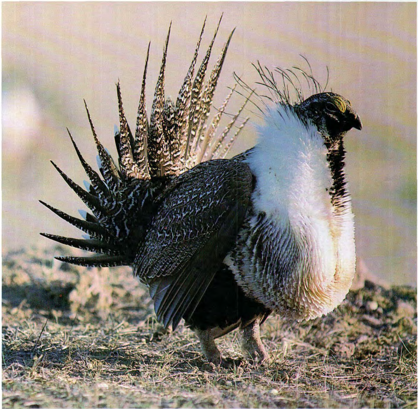
Sage grouse cock displaying.