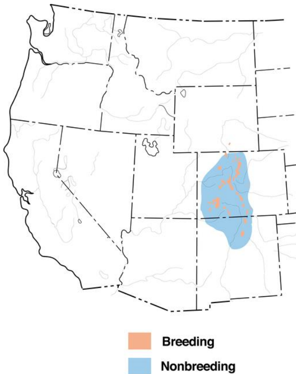
Figure 2: North American range of Leucosticte australis . The breeding range in southern Wyoming is very localized. (Map courtesy of Birds of North America, http://bna.birds.cornell.edu/bna , maintained by the Cornell Lab of Ornithology)