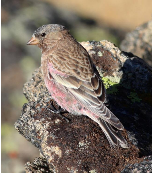
Figure 1: Adult Brown-capped Rosy-Finch in Rocky Mountain National Park, Larimer County, Colorado.