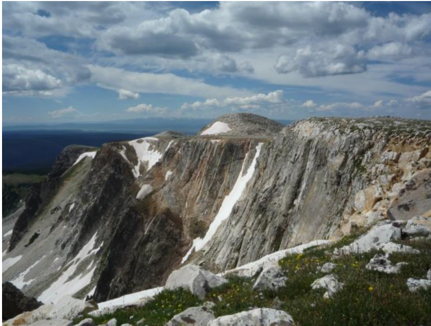
Figure 3: Brown-capped Rosy-Finch breeding habitat, Medicine Bow Peak, Carbon County, Wyoming.