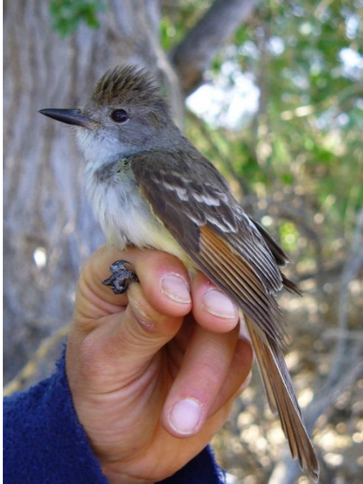
Figure 1: Adult Ash-throated Flycatcher in-hand in Cibola National Wildlife Refuge, California.