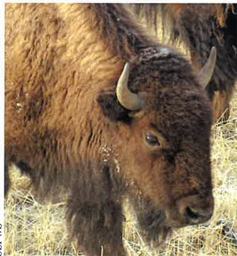
Young adult bison have yet to develop obvious horn shapes that help identify gender.