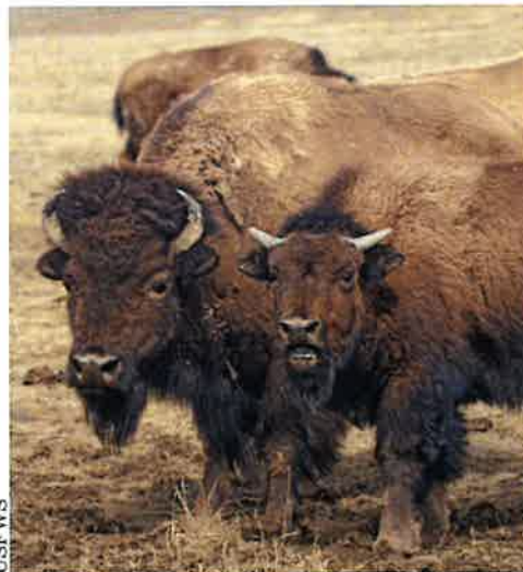
Mature cow with calf. Calves of the year have short straight horns.