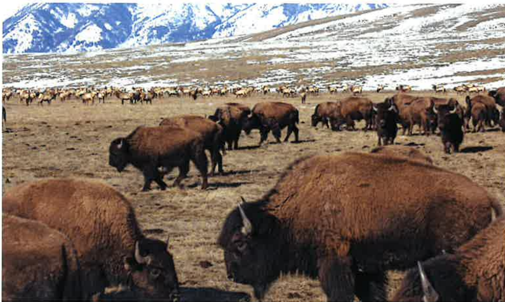
The National Elk Refuge provides winter habitat for elk and bison herds.