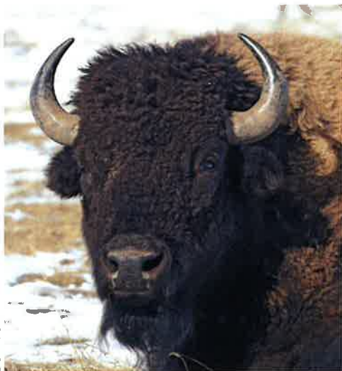
Bull bison on National Elk Refuge.

The Refuge encourages hunters with disabilities to participate in the hunt program and offers reasonable accommodation for the activity. Hunters who have both a WGFD Disabled Hunter Permit and a Refuge hunting permit are eligible to reserve one of two designated hunt sites. Reservations must be made at the Refuge Administrative Offices at 675 E. Broadway in Jackson, WY. The reservation is limited to a 4-day period. The WGFD Disabled Hunter Companion Permit is also valid on the Refuge. Contact the WGFD for further information on these programs.