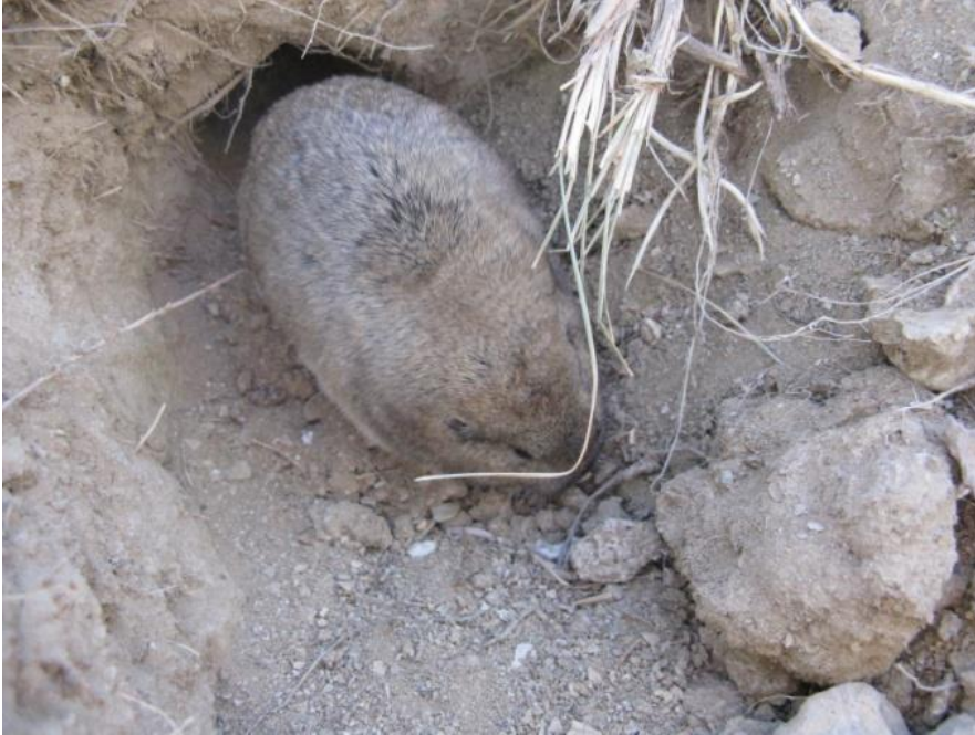
Figure 1: Adult Wyoming Pocket Gopher.