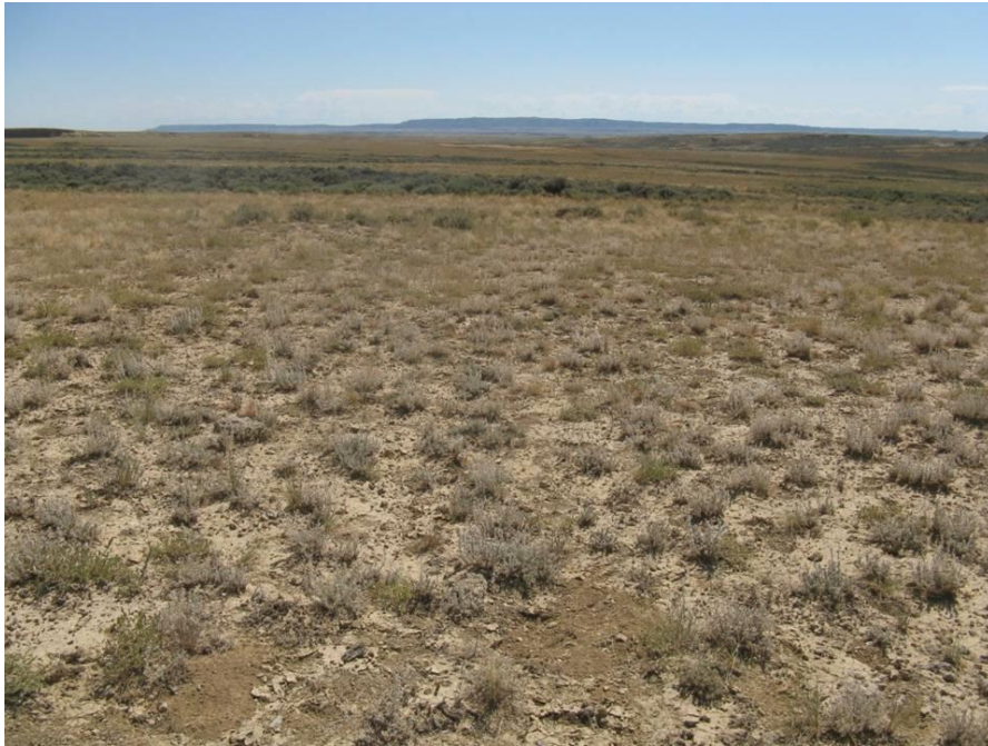
Figure 3: Typical Wyoming Pocket Gopher habitat in south-central Wyoming. Note fresh gopher mounds in foreground of photo.