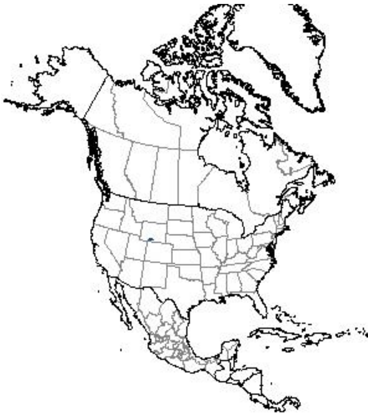
Figure 2: North American range of Thomomys clusius . (Map from: Patterson, B. D., et al. (2007) Digital Distribution Maps of the Mammals of the Western Hemisphere, version 3.0, NatureServe, Arlington, Virginia.)