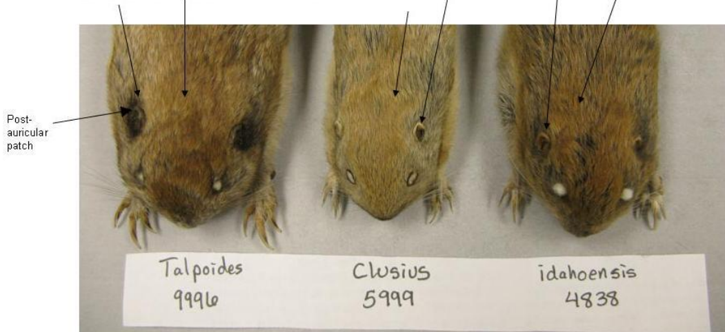
Figure 5: Key morphological characteristics of Thomomys species found in southern Wyoming.

Small, dark post-auricular dark patches. Hair along the margins of the ears match the color of the dorsum.