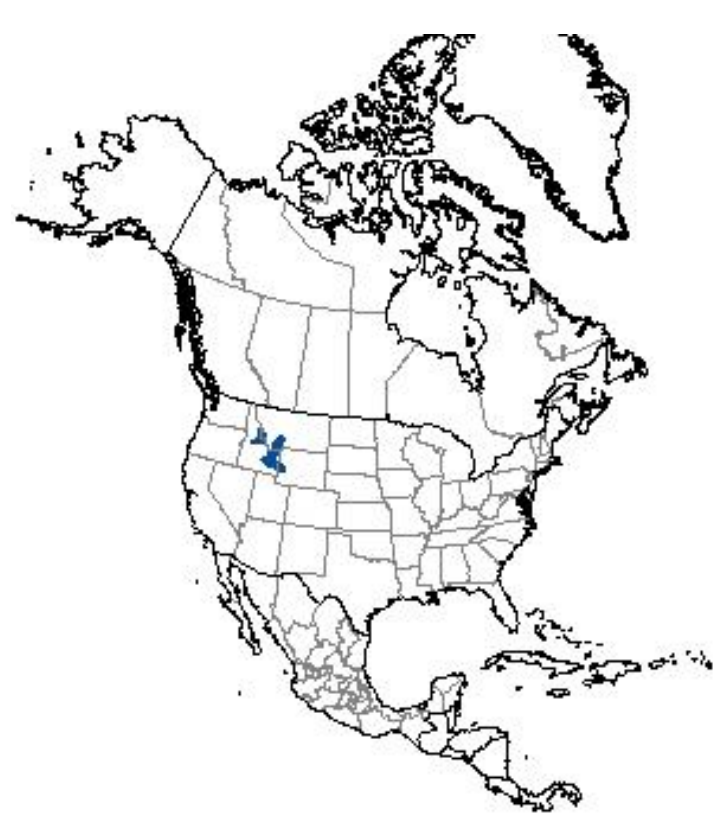
Figure 2: North American range of Thomomys idahoensis . (Map from: Patterson, B. D., et al. (2007) Digital Distribution Maps of the Mammals of the Western Hemisphere, version 3.0, NatureServe, Arlington, Virginia.)