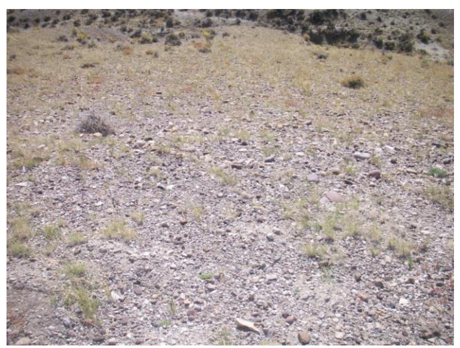
Figure 3: Idaho Pocket Gopher habitat in southwest Wyoming.