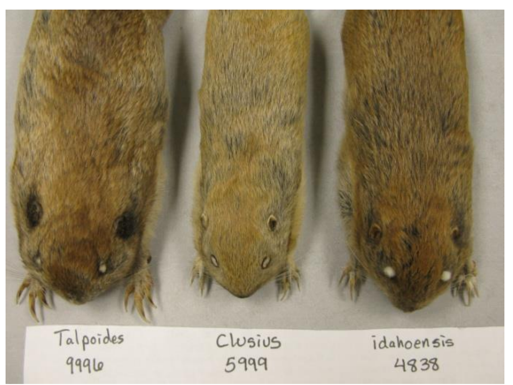
Figure 5: Species comparison between pocket gopher species. From left to right: Thomomys talpoides (Northern Pocket Gopher), T. clusius (Wyoming Pocket Gopher) and T. idahoensis (Idaho Pocket Gopher). (specimens courtesy of New Mexico State University)