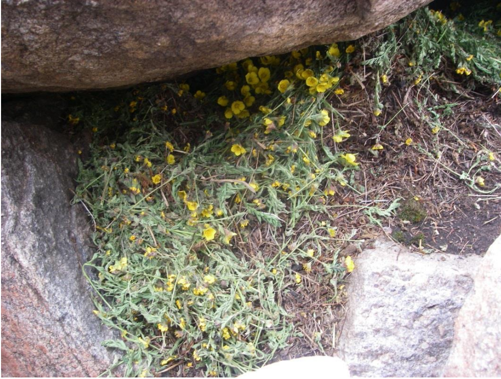
Figure 5: Pika haypile among rocks with old collected vegetation mixed with scat on the bottom, and fresh G. rossii clippings on the surface. This fresh sign is indicative of current occupied habitat.