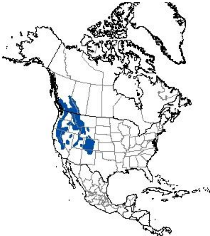
Figure 2: North American range of Ochotona princeps . (Map from: Patterson, B. D., et al. (2007) Digital Distribution Maps of the Mammals of the Western Hemisphere, version 3.0, NatureServe, Arlington, Virginia.)