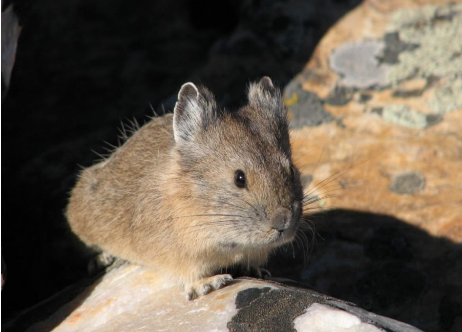
Figure 1: American Pika.