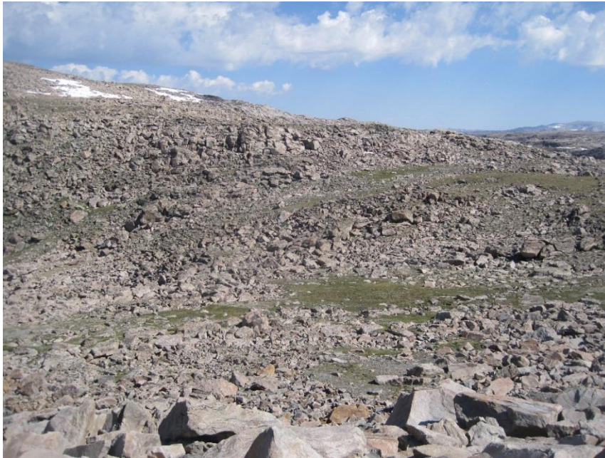
Figure 3: Talus fields intermixed with patchy alpine meadow at 10,900 ft in the Bighorn Mountains, Wyoming.