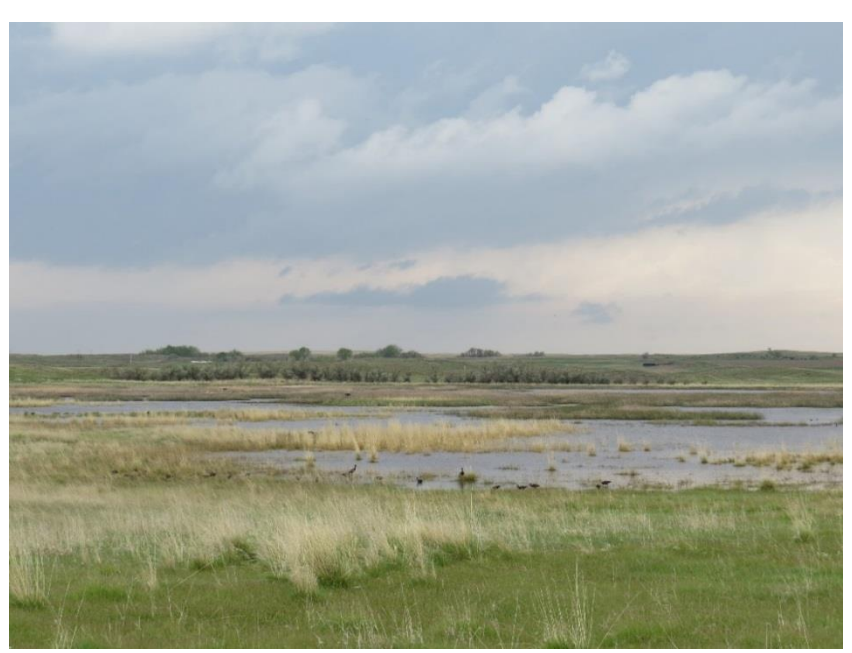
Figure 3: Protected marsh in Table Mountain Wildlife Habitat Management Area with White-faced Ibis visible, south of Torrington, Wyoming.