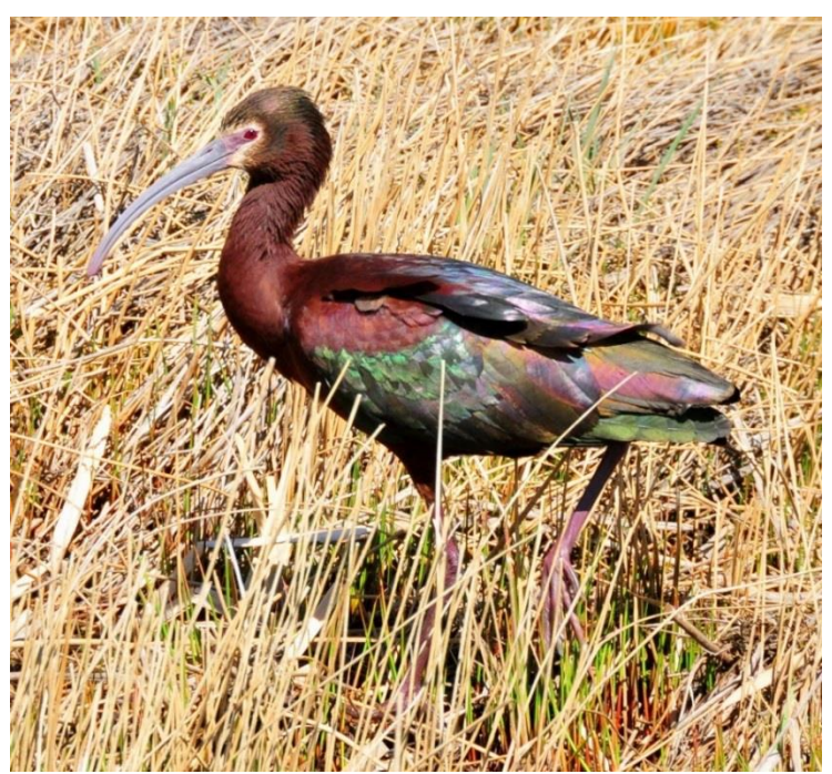
Figure 1: White-faced Ibis feeding in seasonal wetland in Seedskadee National Wildlife Refuge, Sweetwater County, Wyoming.