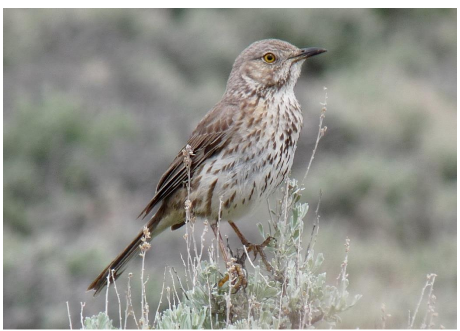
Figure 1: Adult Sage Thrasher in Wyoming.