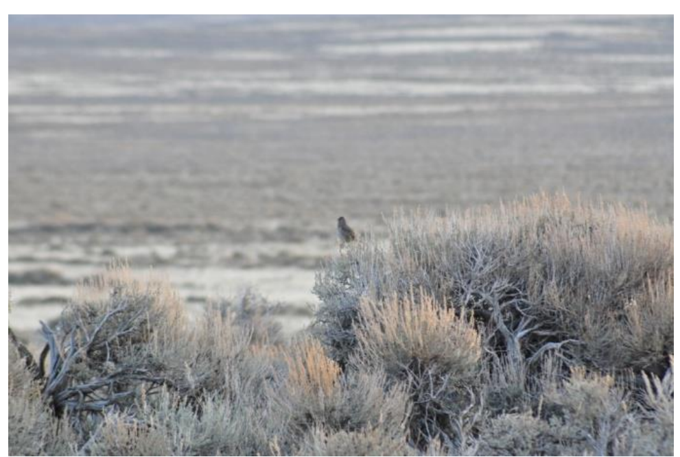
Figure 3: Large, mature, sagebrush typically preferred by Sage Thrasher in Sublette County, Wyoming.