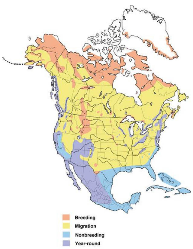
Figure 2: North American breeding range of Falco peregrinus .