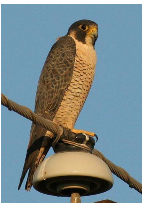
Figure 1: Adult Peregrine Falcon in southern California.