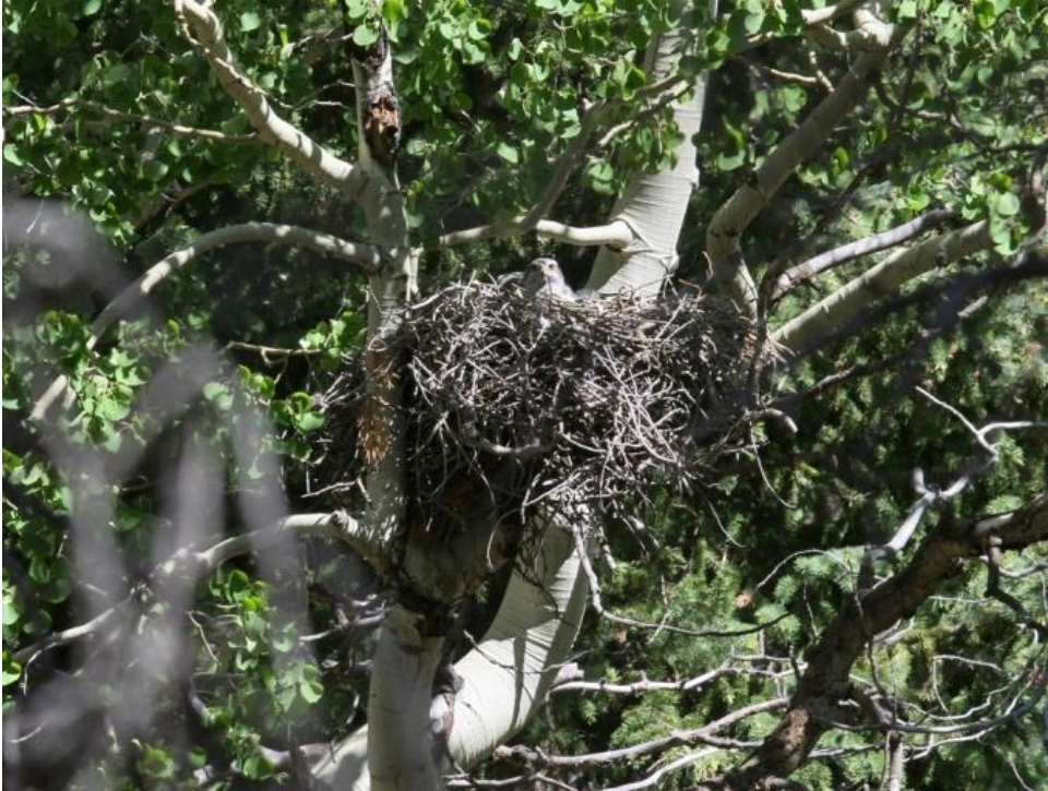
Figure 5: Adult Northern Goshawk on nest in Rocky Mountain National Park, Colorado.