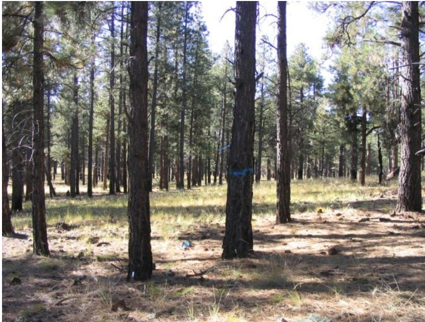
Figure 3: Ponderosa Pine ( Pinus ponderosa ) forest, 1–2 years post burn, on the Kaibab Plateau, Arizona.