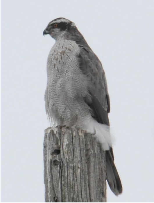
Figure 1: Adult Northern Goshawk in winter, Boulder County, Colorado.