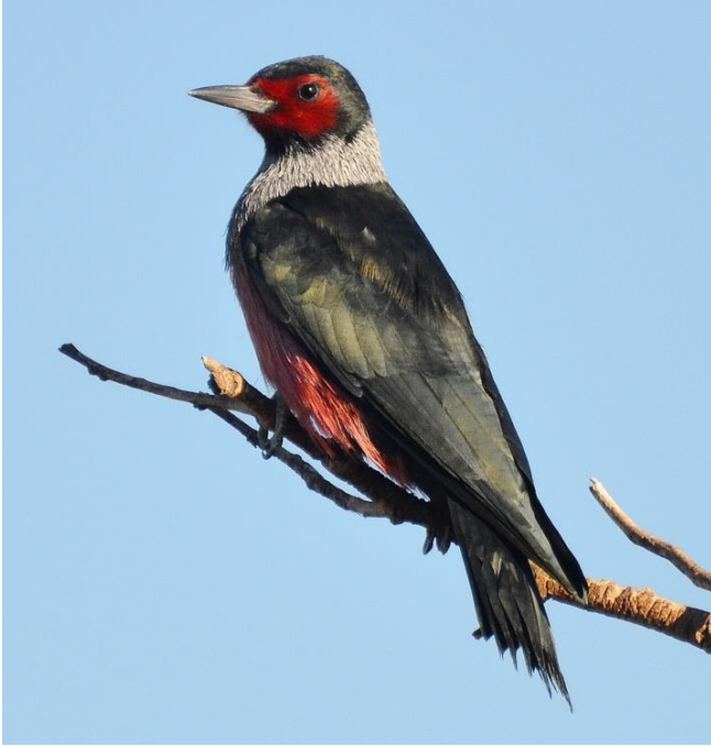
Figure 1: Adult Lewis's Woodpecker in Flagstaff, Arizona.