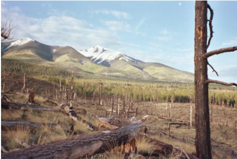
Figure 3: Lewis’s Woodpecker habitat in Coconino National Forest, Arizona, 9 years post-burn.