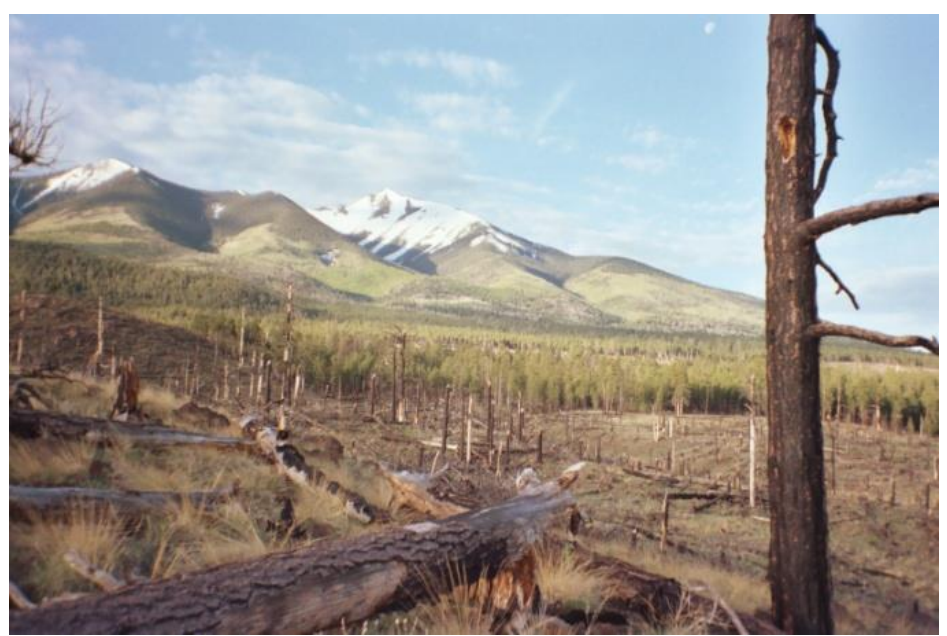
Figure 3: Lewis's Woodpecker habitat in Coconino National Forest, Arizona, 9 years post-burn.