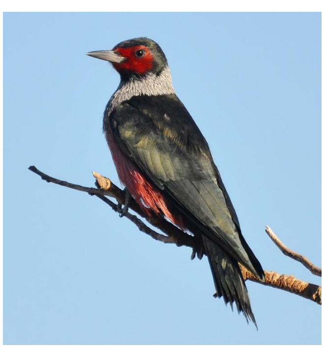
Figure 1: Adult Lewis's Woodpecker in Flagstaff, Arizona.