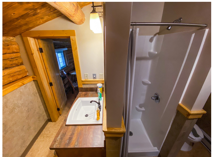
Photos inside of cabins.