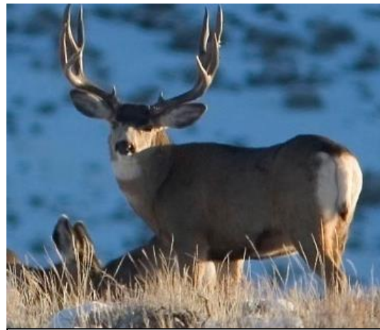
Many animals with CWD show no obvious clinical signs. Even a healthy looking deer or elk may be infected.

The prevalence of CWD is higher in deer than elk, and tends to be higher in bucks than in does. CWD is most prevalent in the southeastern portion of Wyoming. Over the past 30 years, Wyoming has seen CWD prevalence increase, particularly in southeastern Wyoming.