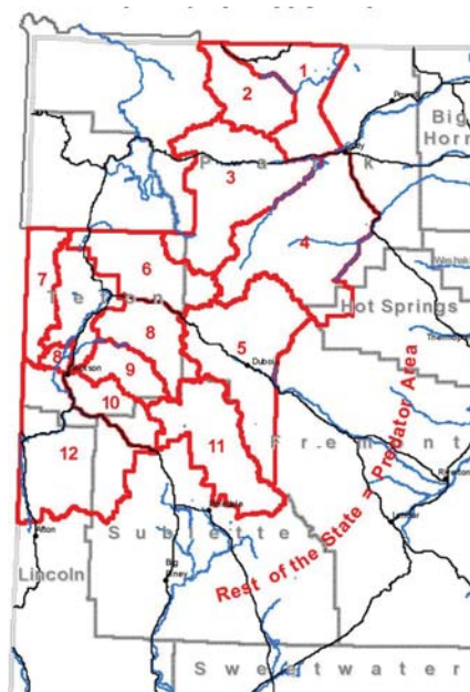
2017 WOLF HUNT AREAS

Q6. Did you hunt Gray Wolf in the Gray Wolf Predator Area ? (check one box) Yes No (If No, your survey is complete.)