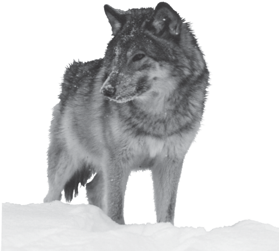
Gray Wolf