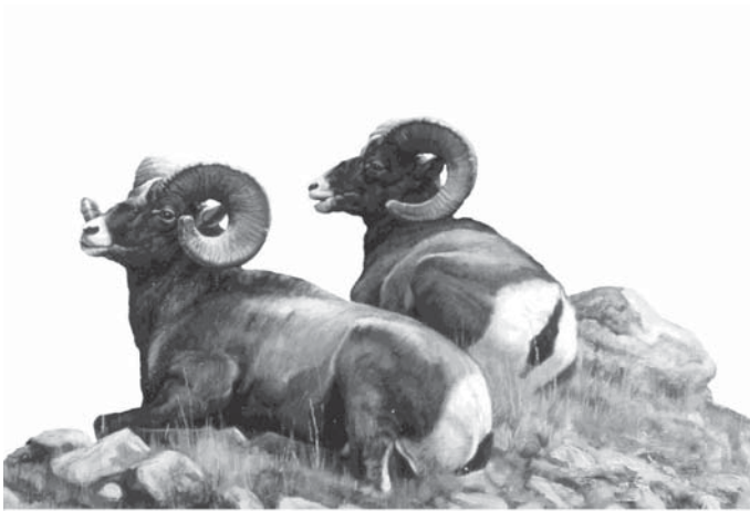
1991 Conservation Stamp Art, Bighorn Sheep by Dave Wade