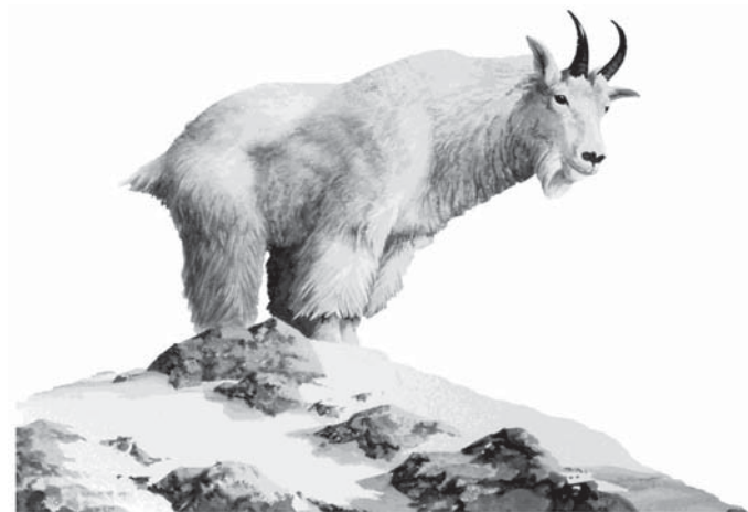
1997 Conservation Stamp Art, Mountain Goat by D. Enright