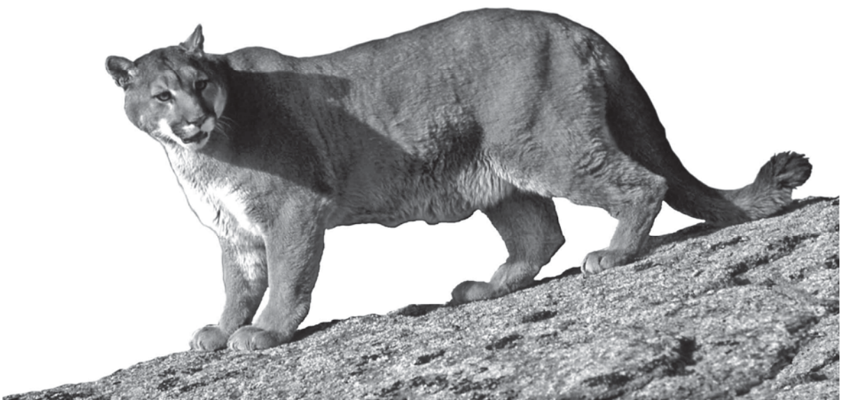
Mountain Lion