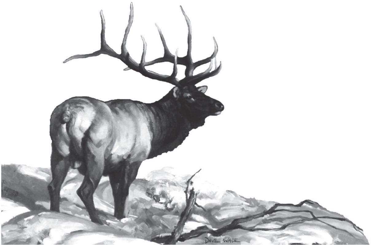
1993 Conservation Stamp Art, Elk by Dave Wade