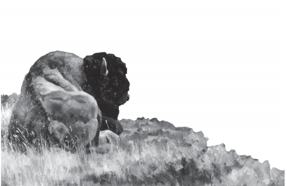
2000 Conservation Stamp Art, Bison by Dave Wade