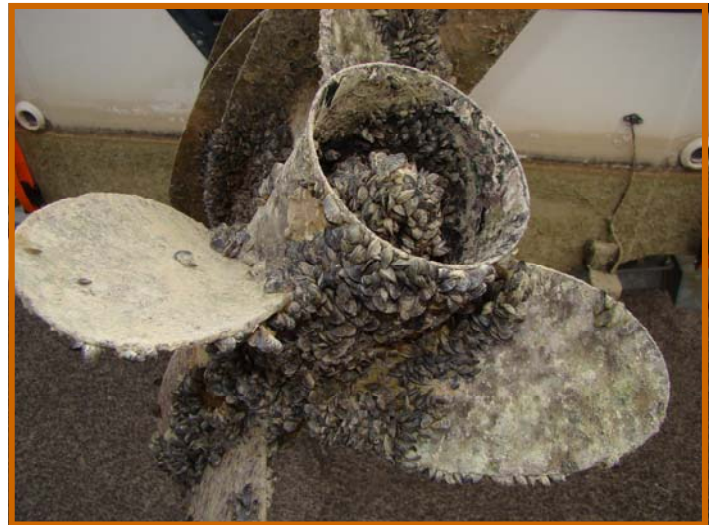
Exotic mussels can completely cover submerged objects and cause significant damage to boats and other equipment.

Zebra and quagga mussels are freshwater, bivalve mollusks, typically with a dark and white pattern on their shells. They are native to Eurasia and were first discovered in the Great Lakes in 1988, most likely transported in the ballast water of ocean-going ships. They are up to an inch long and are often found in clusters attached to hard surfaces such as boats, piers, pipes, and other equipment. Invasive mussels reproduce rapidly. There are no known populations of these mussels in Wyoming to date, but they have rapidly invaded waters across the country and are now present in Colorado, Nebraska and Utah.