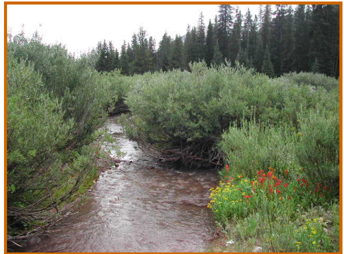
Willows provide shade to help cool streams and provide overhead cover for trout

essary to allow habitat conditions to begin improving. Many examples of this "passive restoration" are occurring along our streams, one being the recent recovery of willow communities in the Lamar Valley of Yellowstone due to reduced levels of elk use. Similarly, willows will often grow vigorously following changes in livestock grazing management.