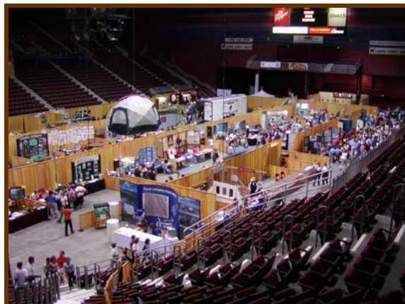
Attendees explore the Hunting and Fishing Heritage Expo at the Casper Events Center