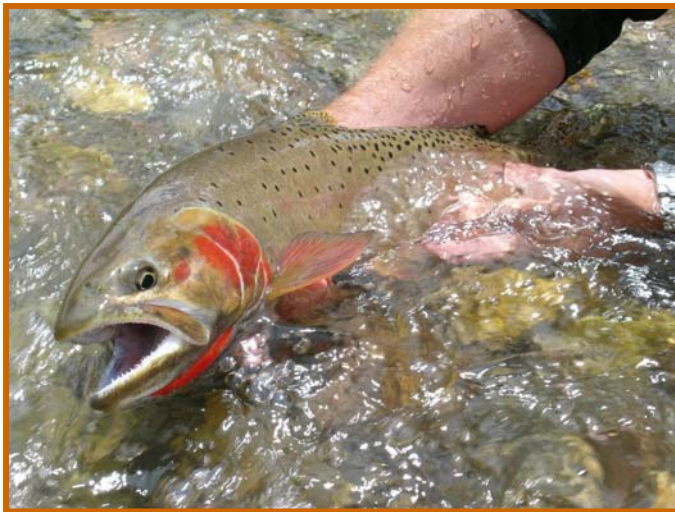
Migratory Bonneville cutthroat trout

The Bear River flows through the southeast corner of Idaho, western Wyoming, and the northern tip of Utah. At over 500 miles, it is the longest river in the western hemisphere that does not reach the ocean, instead arriving at its marshy terminus in the Great Salt Lake. Bonneville cutthroat trout (BRC) are the only trout native to the Bear River drainage, and like most western native trout, have experienced drastic declines over the past century. The primary culprits are habitat loss, fragmentation, and the introduction of non-native competitors - most of which can be directly attributed to humans. As our settlements impacted lower elevation river valleys, native trout were increasingly forced into more isolated, headwater habitats. As a result, the large migratory forms that once inhabited lakes and big rivers began to disappear.