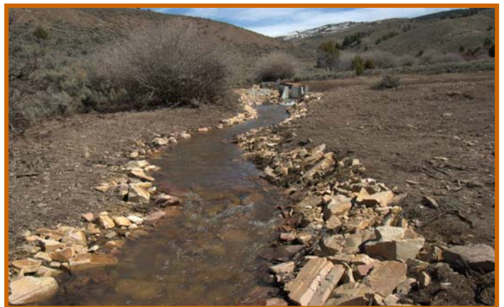
Screened irrigation diversion (background) and rebuilt stream channel on Rock Creek

As a result, the first Bear River project was to install a fish screen and upstream bypass channel at that Thomas Fork diversion. Since then, similar structures have been installed at the other two Thomas Fork diversions, and migratory BRC now move unhindered up and down the system. Between 2007 and 2008, fish screens were installed on two Smiths Fork tributaries to protect out-migrating juveniles and post-spawn adults, and we reconnected Grade Creek to the Smiths Fork for the first time in 50 years by reconstructing ½ mile of historic stream channel and removing an earthen diversion dam to restore flows in the lower creek. In 2008 work also began on Twin Creek, a low elevation drainage between Cokeville and Kemmerer that once harbored large numbers of big cutthroat trout. This year we will complete the last of five fish screens on Rock Creek in the upper drainage. Once fish are protected from the irrigation canals on Rock Creek, we will reconnect the Twin Creek drainage to the Bear River by replacing the B-Q diversion near Sage Junction with a series of fish-passable rock sills and screening the B-Q canal.