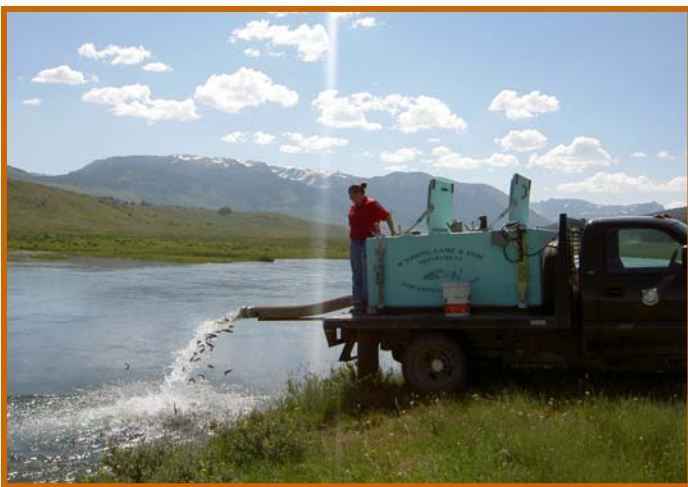
The Daniel Fish Hatchery stocked over 11,000 lbs of fish in Wyoming in 2009.