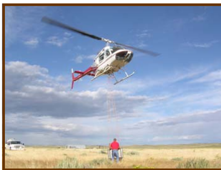
A helicopter prepares to depart with a load of fish en route to remote lakes in the Bridger Wilderness

Every year, thousands of people take to the backcountry of Wyoming in search of adventure. For most, the opportunity to wet a line on one of the thousands of backcountry lakes tops the list of priorities. It is not uncommon for backcountry travelers to encounter a diverse assemblage of native and non-native trout while venturing from one lake to another, causing many to wonder "how did these fish get here?" For more than a few it is likely they arrived via helicopter!