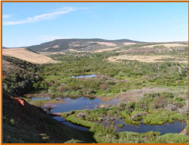
Early explorers reported encountering streambanks lined with woody vegetation including willows, aspen, alder, and cottonwood, and streams with abundant beaver

This may be a common frustration to those of us who enjoy stream fishing, often untangling our leader and retying flies or lures. Some days, it may seem that this task takes almost as much time as actually fishing. Still, I do not curse the willows because I know that they are absolutely essential to maintaining the stream fisheries we enjoy. Unfortunately, willows have not always been thought of so fondly. Historically, willows were viewed as a nuisance, often removed from stream banks, leading to degraded aquatic habitat on many streams. A review of our brief settlement history will help explain.