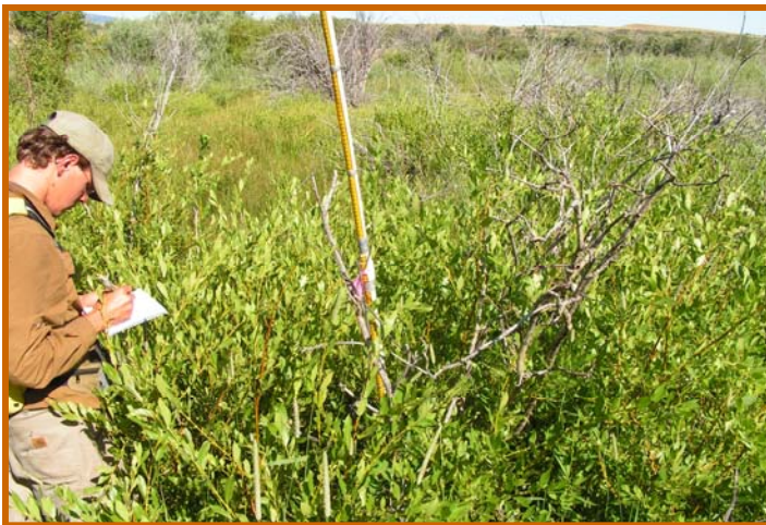
Healthy willows are an important part of many properly functioning streams

Overhanging willows along streambanks also support insects that fall into the water for trout to feed on. Willow leaves, twigs, and other decaying organic plant material provides food to the various other aquatic insects that trout consume. Stems and branches of willow roots also create structural complexity underneath the water, providing fish with cover for hiding from predators while foraging.