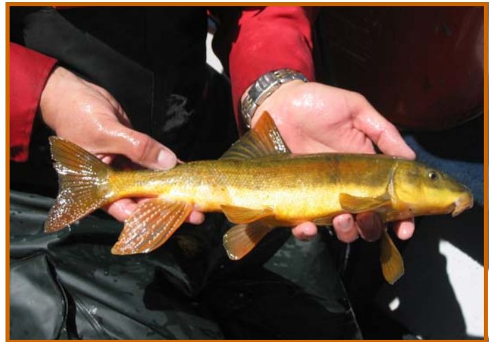
Flannelmouth sucker (above) are among the most threatened species of fish in Wyoming.

tom-dwelling species. They have an inferior mouth located on the bottom of their head, which allows them to sort through the mud, sand and rock for food. Flannelmouth suckers are considered to be omnivores, meaning they eat animals and plants. Though they rarely prey on other fish, they have been known to occasionally feed on their eggs. Flannelmouth suckers typically spawn in the spring, and like several members of the trout family, they will often migrate great distances into smaller rivers and streams to reproduce. Eggs of this species are not deposited into a redd or "nest". Instead, the adhesive eggs are broadcast into the water and attach to objects in the water or the substrate where they settle.