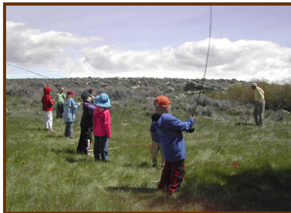
Children learn valuable angling skills at the annual "Get Hooked on Fishing" event at the CCC Ponds

All kids ages 13 and under are encouraged to attend the annual "Get Hooked on Fishing" event hosted by the Wyoming Game and Fish Department, U.S. Forest Service, and Trout Unlimited. There will be a series of short educational activities, free lunch, and the opportunity to catch a variety of freshly stocked trout in CCC Ponds. Youngsters will have the opportunity to learn basic ecology and fish I.D., fishing skills, and gear applications. Some fishing gear and bait is provided, and the event is free to the public.