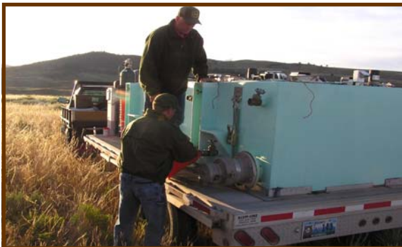
Fish are transferred from trucks to stocking tanks prior to departure.