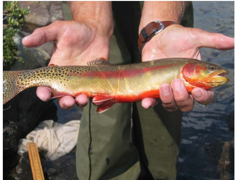
Golden trout from the Wind Rivers.

years the Department has collected eggs from a lake in the Wind Rivers. In 2005 golden were stocked on the west side of the continental divide, and in 2006 golden trout will be stocked in the Wind River Mountains on the east side of the divide. Stocking in wilderness lakes only occurs in those waters that lack spawning habitat and cannot maintain a viable population through natural reproduction. Though the number