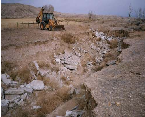
During installation of gully plug at Bain Draw area.

The irrigation returns from the irrigated fields on the Spence/Moriarity Wildlife Habitat Management Area (WHMA) have created some large gullies, which have a negative impact to the East Fork fisheries. The designs for the Save Ocean Lake grade controls used broken concrete from the rehabilitation of the Midvale Irrigation delivery system. These grade controls have been in place for over 15 years and have functioned as designed. The Dubois Hatchery rebuild involved removing the old concrete raceways, which were going to be hauled to the local landfill, at an extra expense to the Game and Fish Department. Putting these two ideas together, a stabilization project was completed, using concrete from the hatchery to install gully plugs in drainages flowing into the East fork River. The Statewide Habitat