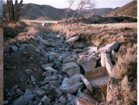
Completed gully plug near Mason Draw.

Access Maintenance Section and Dubois Hatchery were able to coordinate the removal and storage of the concrete on the Spence/Moriarity WHMA for later use for the gully plugs. The gully plugs were installed at two sites during the fall of 2005. There is additional concrete stored for future gully plugs, if this technique is successful in this area.