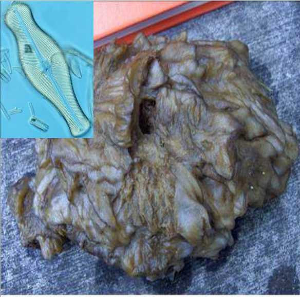
Didymo is a microscopic algae (diatom) whose single cells are not visible to the naked eye (top left), but it forms large colonies that can cover a stream bottom.

Didymo ( Didymosphenia geminata ) is a freshwater diatom which has historically been found in the cool, clean waters of northern Europe and northern North America. Since the mid-1980s, it has begun to take on the characteristics of an invasive species in its original range, and is being found in new areas. Recently it was confirmed in the Middle Popo Agie River.