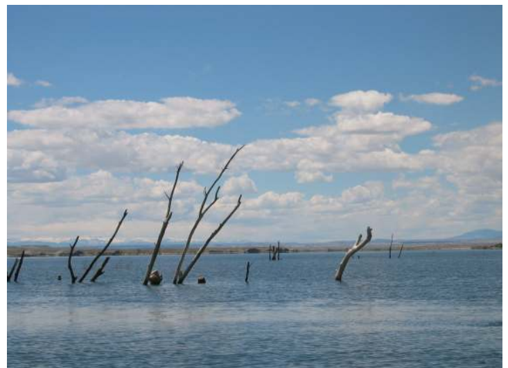
Tree structures placed in Boysen Reservoir for fish habitat.

To attract crappie for the purpose of enhancing fishing opportunities at Boysen Reservoir, fisheries biologists are sinking trees in the bays just north of Tough Creek. Black crappies prefer habitat that provides 50% to 90% cover. This year we'll be working approximately two weeks on this project collecting trees and brush, forming concrete weights, and sinking trees. We sank 21 trees last year and expect to sink about 30 trees in 2006. Members from the North Platte Walleyes Unlimited club (NPWU) from Casper, have been interested in this project. The NPWU chose to provide $2,800 for materials required for this year's work. Information for the NPWU is located on the web at http://www.npwalleyes.com/ . We'll be evaluating the habitat structures in 2007 to determine if they are being inhabited by fish.