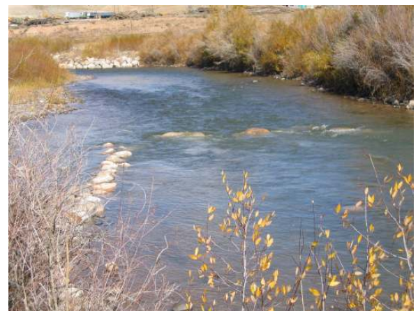
“J” Hook Structure