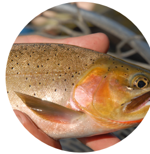
5. Cutthroat Trout