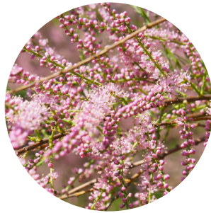
4. Salt Cedar