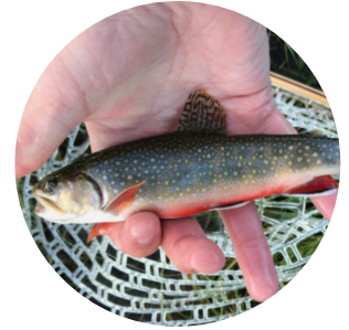
3. Brook Trout