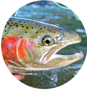
1. Rainbow Trout

Are these plants and animals native to Wyoming? Circle your answer, then check to see how well you did!