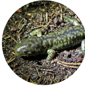
2. Western Tiger Salamander