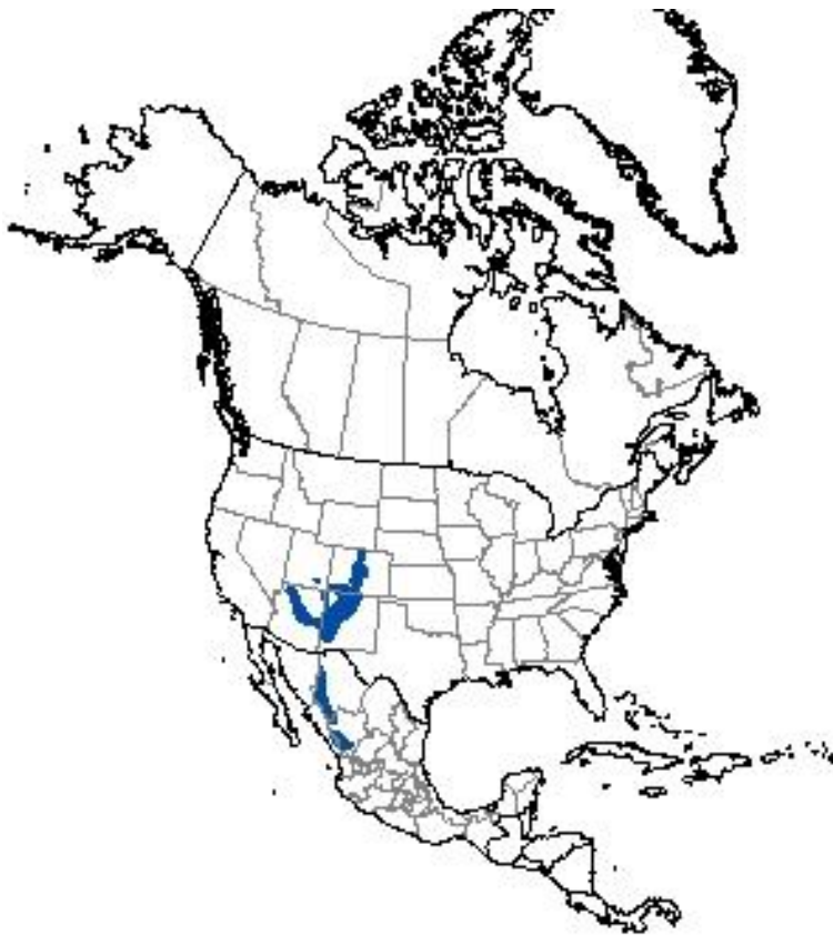
Figure 2: North American range of Sciurus aberti . (Map from: Patterson, B. D., et al. (2007) Digital Distribution Maps of the Mammals of the Western Hemisphere, version 3.0, NatureServe, Arlington, Virginia.)