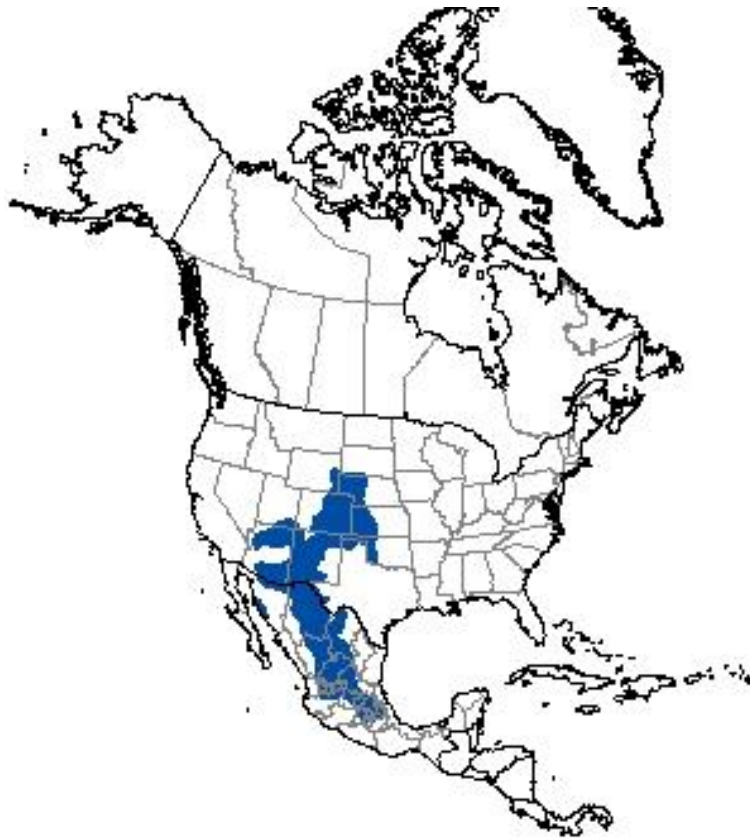
Figure 2: North American range of Perognathus flavus .