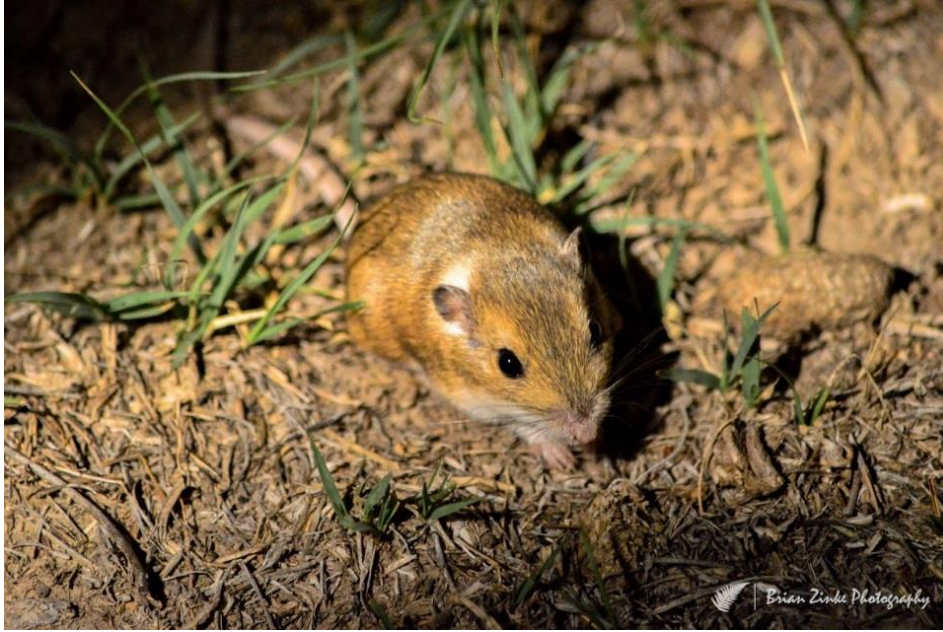
Figure 1: A Silky Pocket Mouse in the short-grass prairie of Logan County, Kansas.